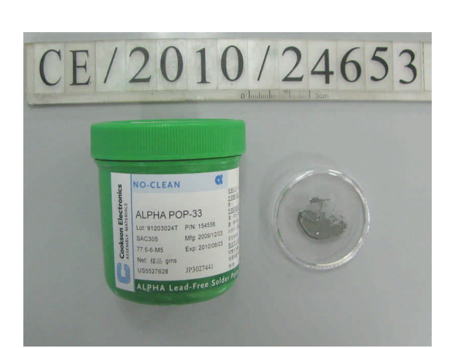
** 報告結尾(End of Report) **

NO. 4, LANE 100, SEC. 2, NAN SHAN RD., LU-CHU HSIANG, 338 TAOYUAN, TAIWAN