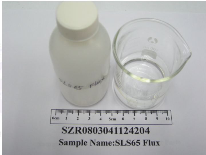
Photo of the sample